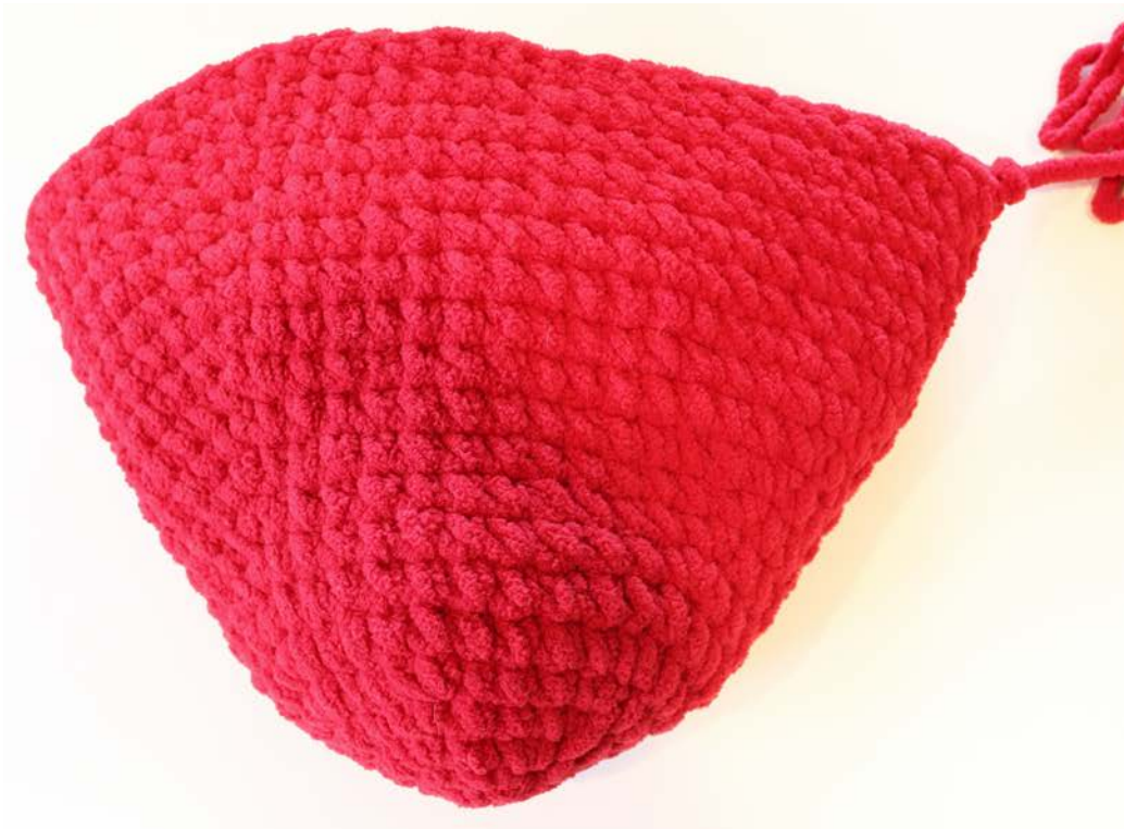
Picture 2 - Bottom Part of Heart

Rnd 20: 1 sc in each of next 60 sc, Sl st to next sc. (60 sc) Fasten off; leaving a long tail of yarn for later.