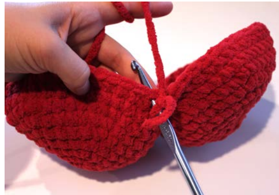
Picture 5 - Join and work 60 sc around

Rnd 1: 1 sc in each of next 60 sc, Sl st to first sc. (60 sc) Fasten off.