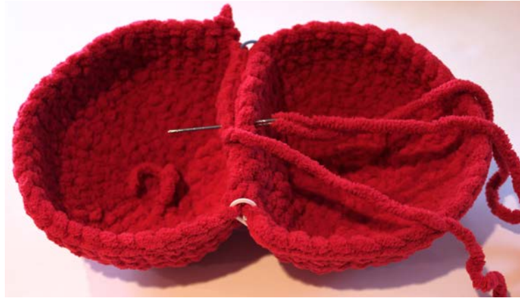
Picture 4 - Sew 12 sts from each piece together

Place the two Top pieces next to each other and with the help of st markers, mark the beginning and end of 12 sts from each piece facing each other. With remaining tail of yarn from one of the top pieces and yarn needle sew the 12 sts together so the 2 pieces of become one Top piece with 60 sc in total around. (see picture 4)