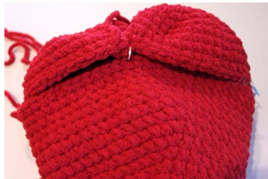
Picture 6 - Use st markers to hold pieces in place

Use st markers and mark 4 joining parts to sew Top piece over Bottom piece together, but make sure to leave a gap to stuff the heart. Once you are done stuffing firmly, sew the gap closed.