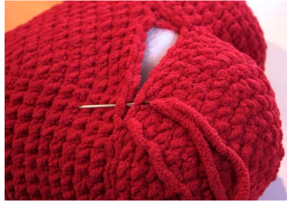
Picture 7 - After stuffing close the gap